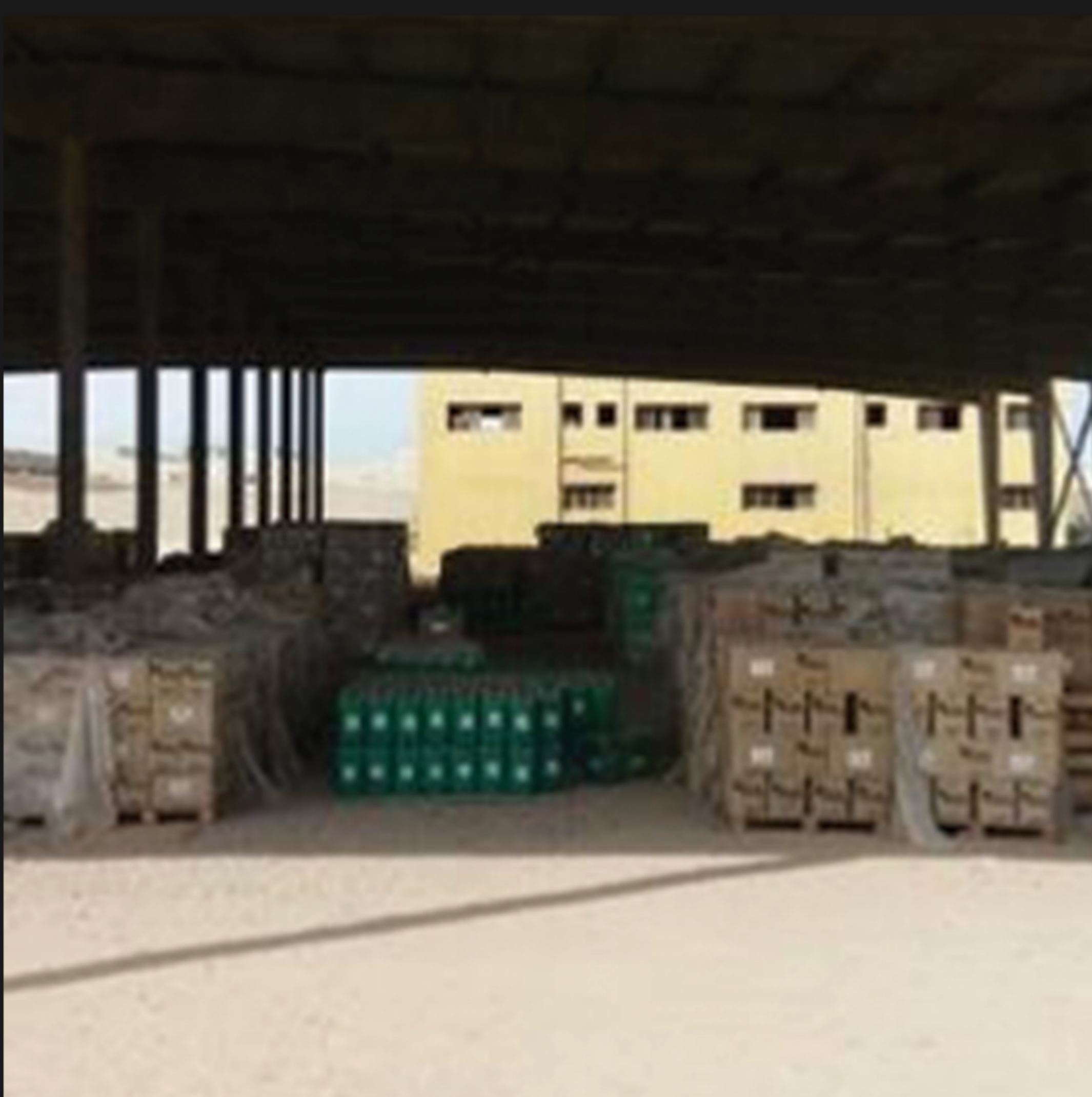
October Storage Warehouse