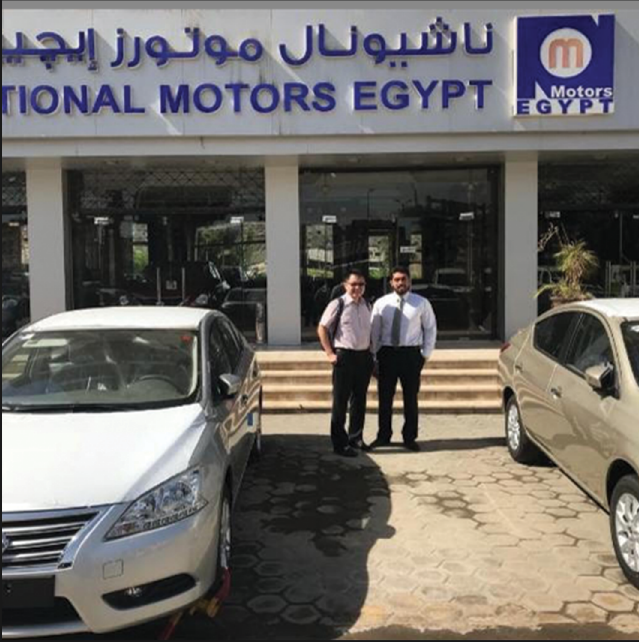
Maadi Branch – Head Office