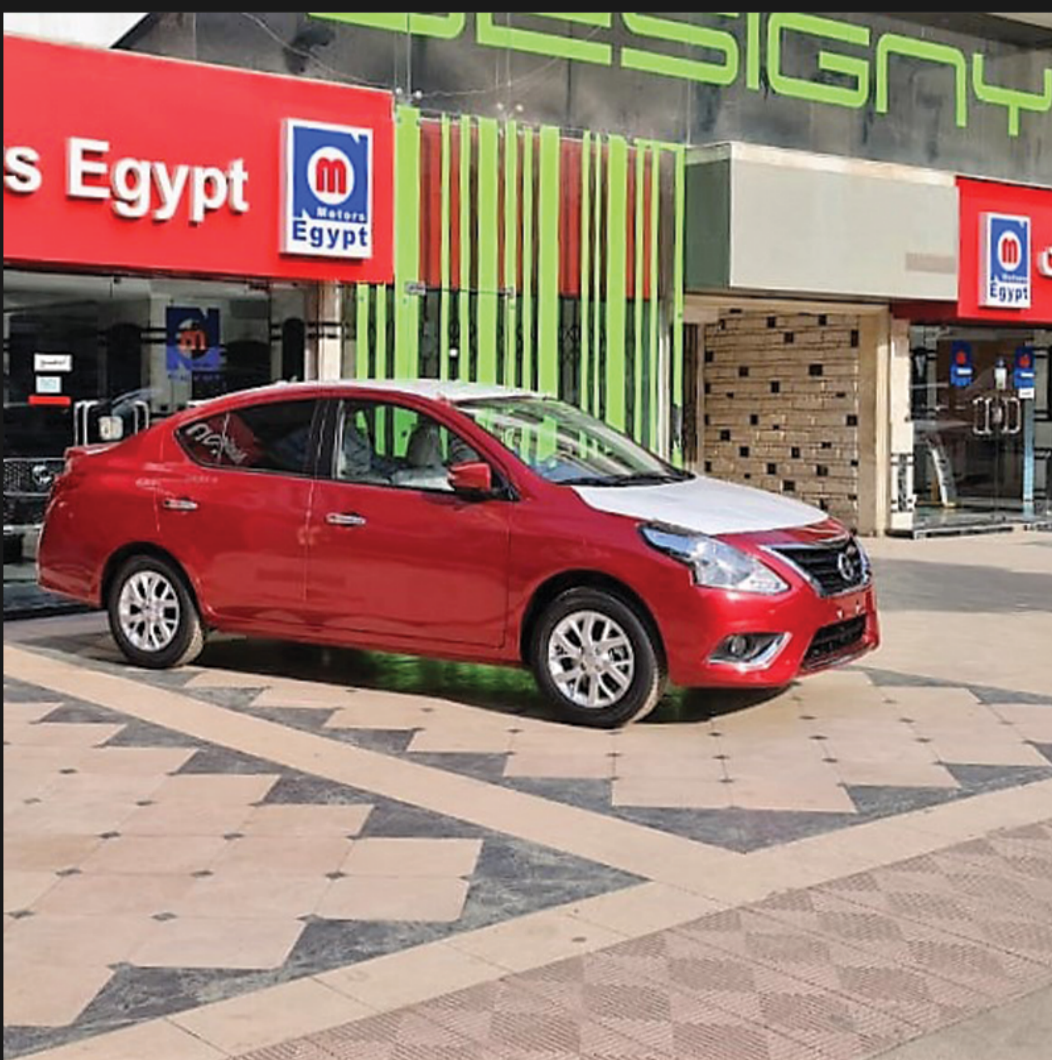
Nasr City Branch